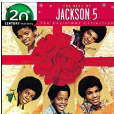
The Jackson 5 Christmas Collection

So, as we said before, we all agree that we want this new show to talk about things other people might not talk about. And -- I may not have said this soon enough -- we plan to have fun doing this.