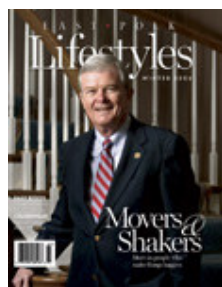
East Polk Lifestyles

Yet a 2003 Gallup Poll found that less than half of all lesson takers stick with it through high school. Use these expert tips to get your child to try an instrument -- and to keep her hooked.