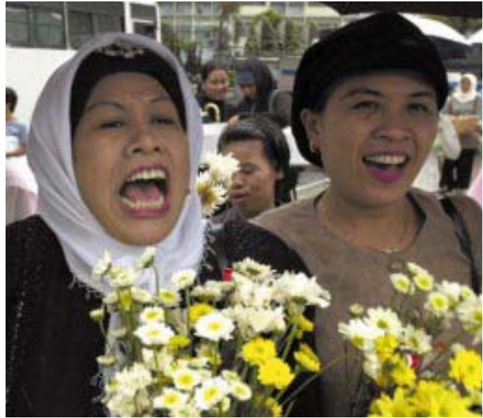
Clockwise: A Chilean woman speaks out against former dictator Augusto Pinochet; Indonesian women call for peace as they protest the parliamentary committee investigating President Abdurrahman Wahid for alleged corruption; Japanese activists demand the withdrawal of U.S. Marines from Japan.