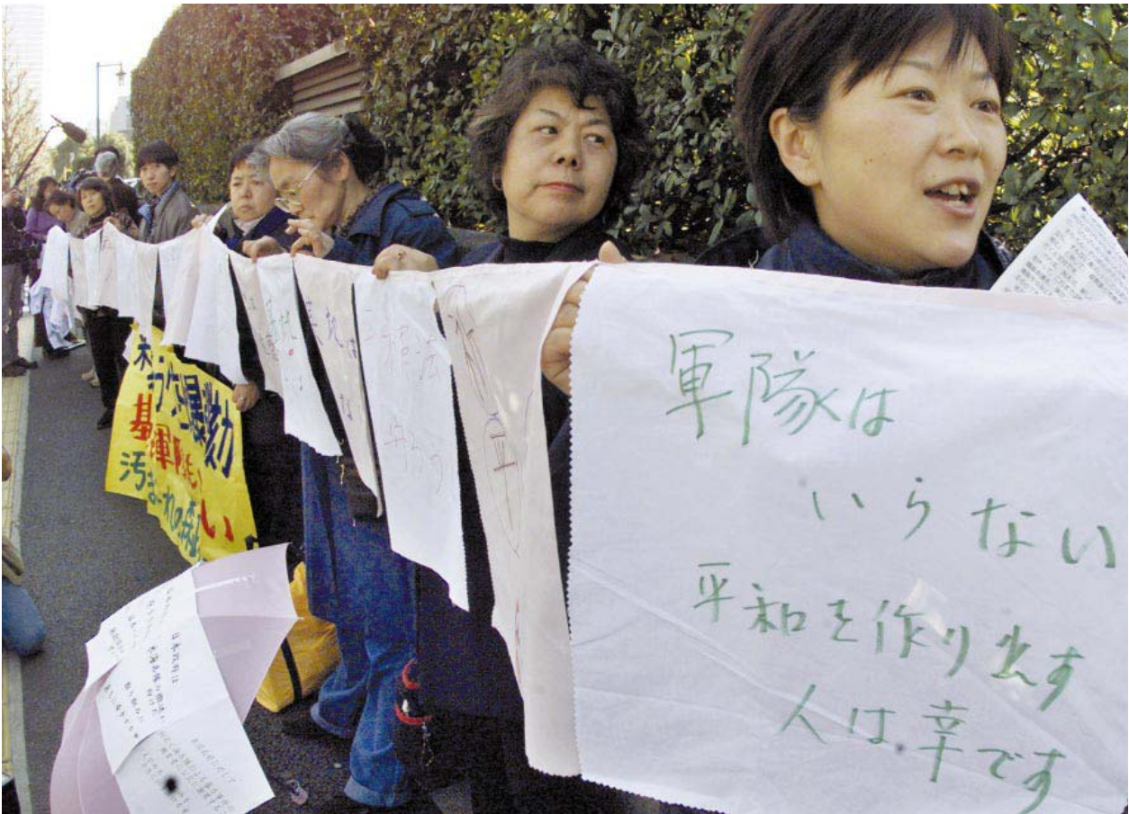
CLOCKWISE: J. R. RIPPER/SOCIAL PHOTOS; ACHMAD IBRAHIM/AP; TOSHIYUKI AIZAWA, REUTERS