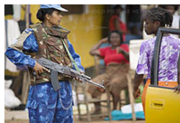
Indian peacekeeper in Monrovia, Liberia, 2007

As of February 2009, 874 of 9,911 U.N. peacekeepers were women, a