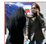
Women and Islam