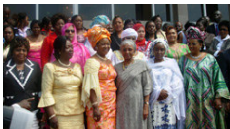
Africa's first ladies pose for a group photo in Brazzaville after setting up a network of peace negotiators

BRAZZAVILLE, 18 February 2008 (IRIN) - In a bid to support initiatives to restore and strengthen peace on the unrest-prone continent, wives of African heads of state or their representatives have formed a conflict-resolution group.